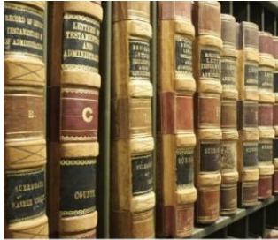
WAR EXPENDITURES: HEARINGS ...